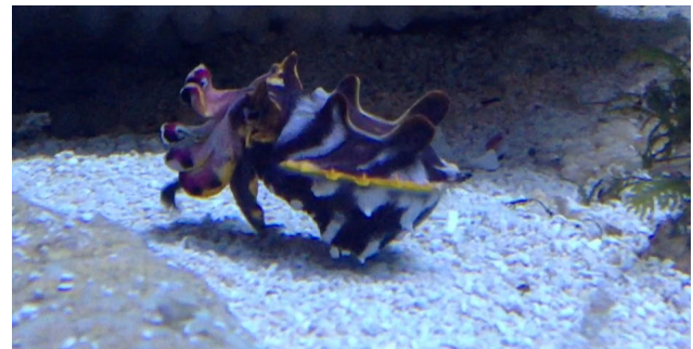
Flamboyant cuttlefish ( Metasepia pfefferi ) walking along the bottom of its tank